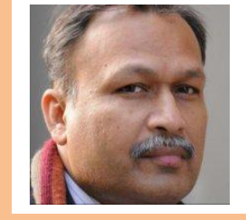
Spl. Chief Secretary, School Education Department, Govt. of Andhra Pradesh, Amaravathi